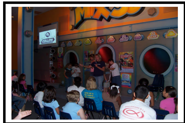
MIX56...our preteen church!

Also included in the EDGE ministry involvement program are coaching sessions hosted by seasoned ministry team leaders throughout the church. Each coaching session also includes an open door policy of questions and answers for those students wanting more insight into specific areas of ministry.