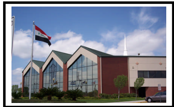
Main Campus today!