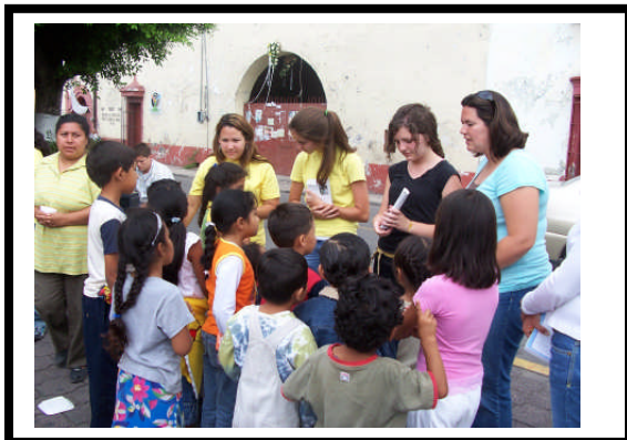
Teaching inner-city youth about Jesus!

With special fundraisers planned through out the year and corporate sponsorships available on several trips, it is a given that a typical EDGE student will encounter the full missions experience. Along with fundraising support, students will cherish these selfless moments of servitude.