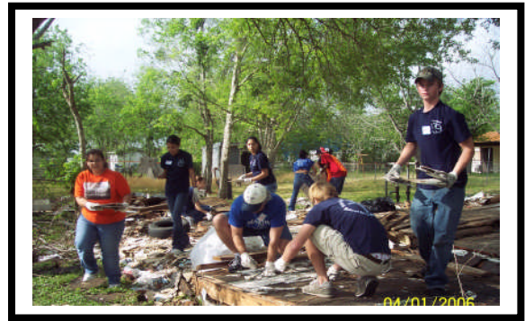
Servolution home repair!

Several trips are planned throughout the year. Each short-term trip is designed to allow students to experience God's love through world missions. The passion that EDGE students have must be shared with the world.