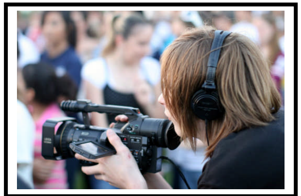
Hands On Training...

Leadership 101: The basic leadership laws are studied that will enable you to increase in your leadership knowledge and giftedness.