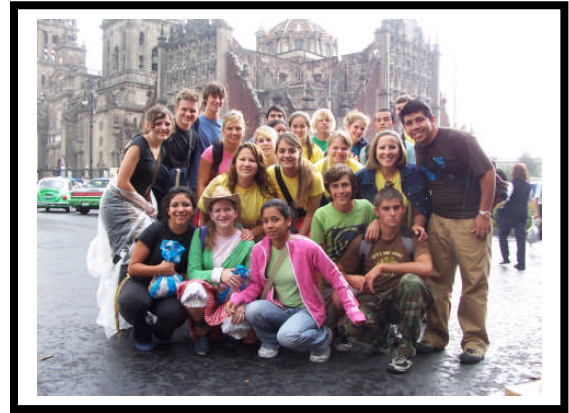
Mexico City – The Zócalo

EDGE is a ten-month internship dedicated to developing the leaders of tomorrow. Designed with all young people in mind, EDGE is committed to establishing Godly Foundations in the heart of every graduate through a unique blend of Biblical Studies, Theology, and Practical Studies. EDGE also offers a second year option for students wanting to train for full time ministry, learn a specific trade, and enter our “career-placement program.”