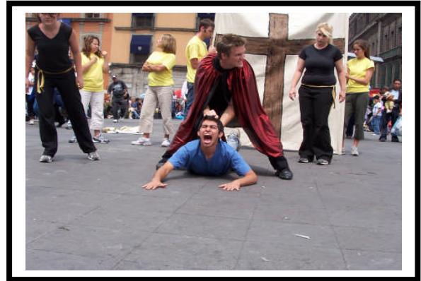
Street ministry Drama!