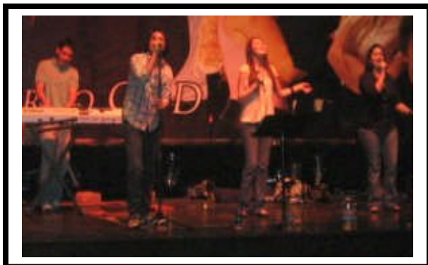
EDGE Rally – Huntsville, TX!

With over 300 areas to get ministry training within our program, students will find a wide variety of training and a core of faithful leaders to help them in their training journey. Once connected to a ministry team, each student can count on the support of supplemental literature and meetings to guide their experience.