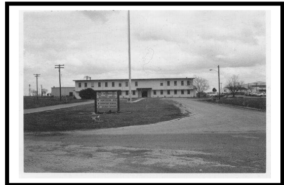
The first building... 1978

Located on 40 acres and two campuses, EDGE finds its home in beautiful Victoria, Texas. Known as the Crossroads for its geographic position between 4 major cities (Houston, San Antonio, Austin, and Corpus Christi), Victoria allows each student the benefits of a home town along with the perks a short road trip away from a major metropolitan or a day trip to the beach. Based out of the thriving 4,000 member Faith Family Church, EDGE allows students to cross all spectrums of ministry opportunity from media and technology, to missions and worship, the possibilities seem endless in our home away from home. Supported by our state-of-the-art facilities, EDGE is leading the way in training young people to lead cutting edge ministries across the country.