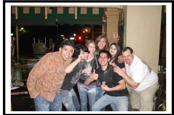
Café Du Monde