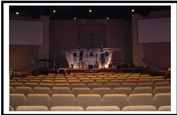
Setting Up The Rig!

Separating EDGE from all other Bible schools is the wide variety of “hands-on” training students receive during services and events. During these events involving thousands of guests, EDGE students become a “trained and ready” ministry team. Emphasis and grades are placed upon their heart attitude instead of performance. During these valuable “Ministry Labs” students discover they really can “do all things through Christ.”