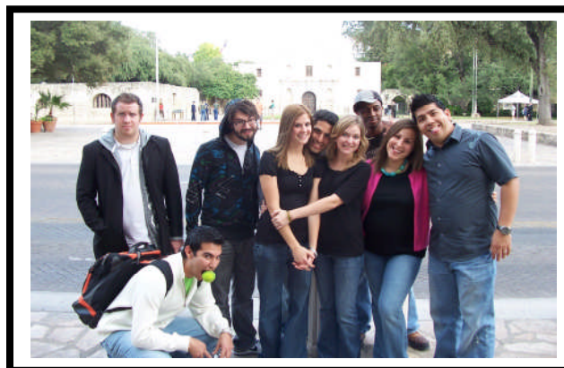
Remember The Alamo!