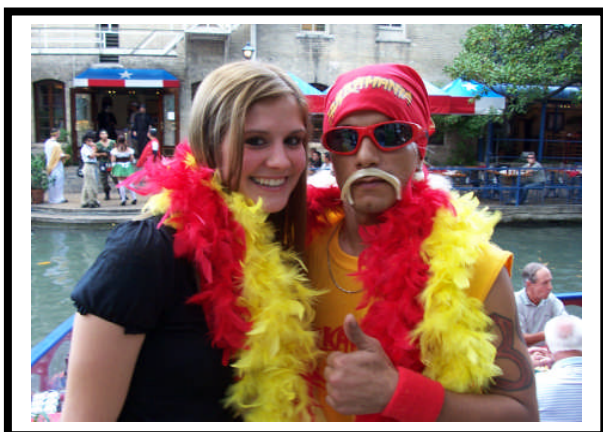
On The Road...Meeting New People