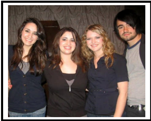
SPRING TOUR – “TOMBS”

Specifically developed for post high school graduates ages 17-25, EDGE find its roots in a grounded Bible school that has seen hundreds of graduates “finish the course” and lead successful and productive lives. Based on Biblical principles and dedicated to providing students with an incredible ministry experience, it’s no wonder why EDGE is quickly becoming a hub of training for a new generation of leaders.